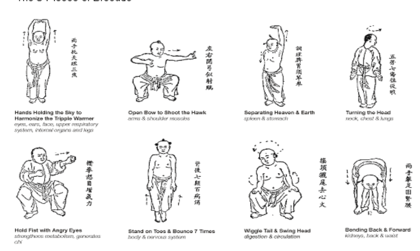
The 8 Pieces of Brocade

Now we go into a brief description of each of the 8 forms. There are actually 10 presented here as it is typical to begin and end with some general warming-up and warming-down actions. Make sure you practice each one slowly and relax. The breathing method used is down to ability and experience. I shall indicate where to slowly inhale and exhale during each action.