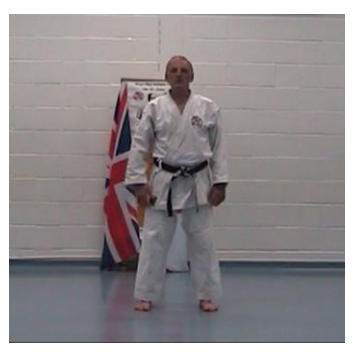
第五段錦 摇頭擺尾去心火 Yo To Haibi Kyo Shin Ka. The fifth piece involves moving the right leg once again to the straddle stance, breathing in and placing the fingers on top of the knees, thumbs on top of the thighs. Your mind should lead energy to the soles of your feet. Shift the weight to one leg and press down with the hand on the side of the straighter leg. Bring your head, spine and supporting foot into line. A slight lean forward is allowed in this one as we breathe out, aiming the breath towards the supporting foot.